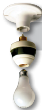
PIR725 Motion Sensing Light Socket

ALSO AVAILABLE: EL53W-2 - 3-Story Length