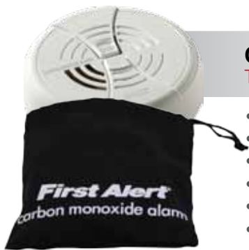
CO250T Travel CO Alarm