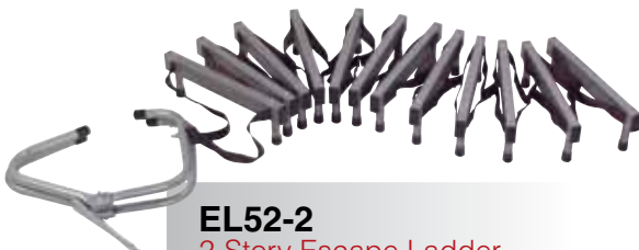
EL52-2 2-Story Escape Ladder