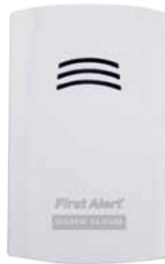
WA100 Water Alarm