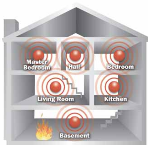
Onelink Alarms All Alarms Respond As One!

NEW TECHNOLOGY PROVIDES NEW OPTIONS , you can enjoy the same level of protection that new homeowners receive without the cost of an electrician.